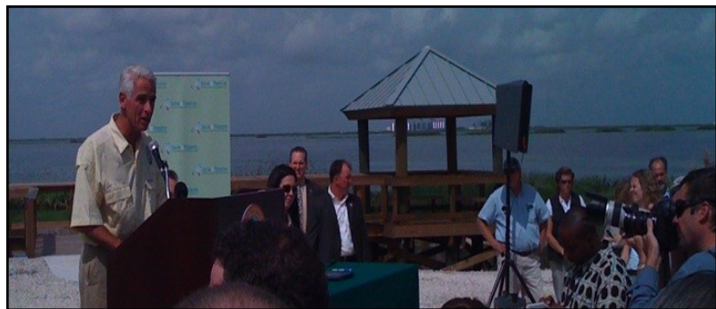
Florida Gov. Crist at the signing of the plan to buy U.S. Sugar Corp.'s 187,000 acres.

My husband and I arrived at the announcement site just as the Governor's entourage came dashing in, and we ended up being part of his escort team as they helped the governor--on crutches--into the